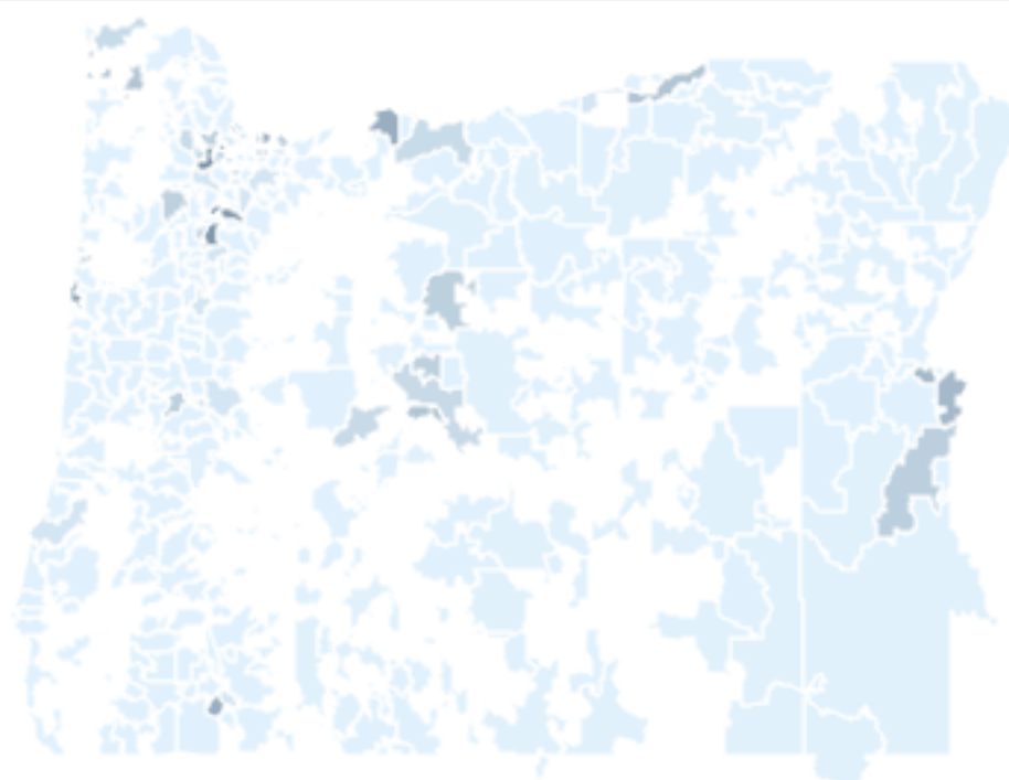
Financial Relief Distributed to Oregonians in Need