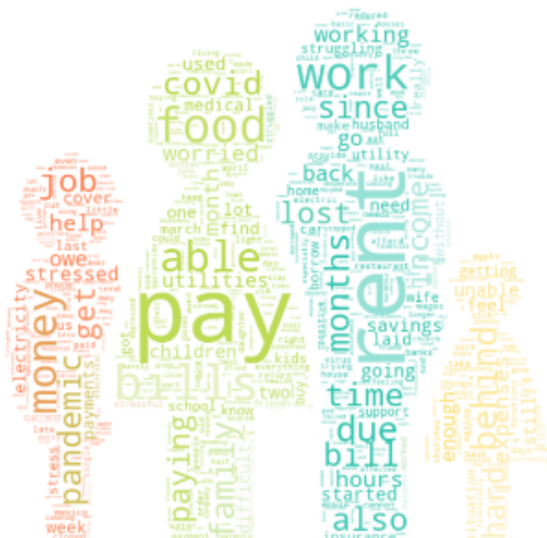
Most Frequent Words in Applicant Hardship Statements

Average waiting period between application for relief and approval.